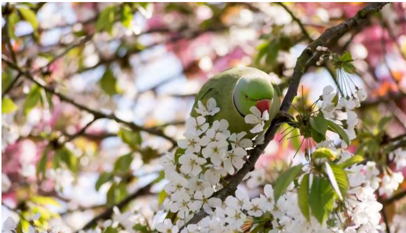
A parakeet in a cherry tree

These were added to in autumn 2019 when 25 new cherry trees were planted in the Royal Parks, a gift from Japan as part of the Japan-UK Season of Culture 2019-20. With spring 2024 set to feature some amazing displays of colour, here are ten facts you might not know about the spectacular trees.