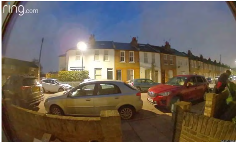
Photo of the thief in action

Bikes are a prized possession in my native Uganda, where such luxuries were rare. Despite my initial struggles, learning to ride the thing, it became a cherished asset of mine. Only to be stolen the following summer in 1994. I was heartbroken and I got myself in a lot of trouble for not being vigilant.