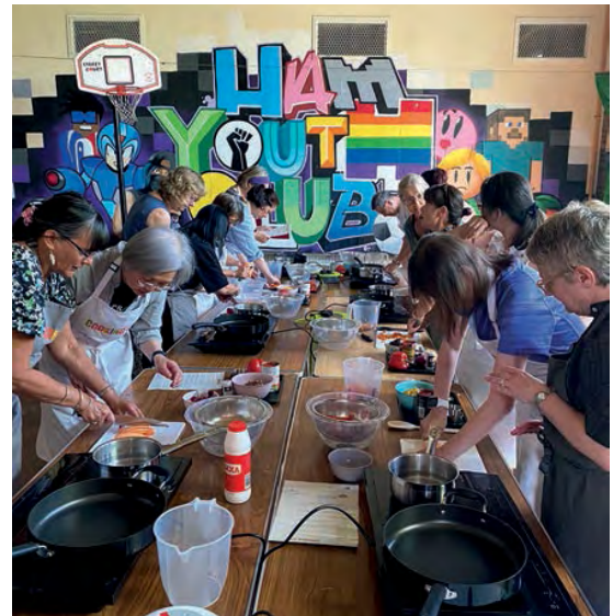
Residents on a Cooking Up course in Ham Youth Centre